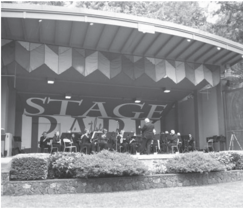
The Greater Victoria Concert Band's Senior Band at the Cameron Bandshell, Beacon Hill Park, June 2013

The Greater Victoria Concert Band includes over 100 musicians, all working together to enjoy playing. We have musicians from all walks of life: students, music teachers, engineers, lawyers, accountants and more. We play 10-12 concerts a year throughout the Capital Region and beyond.